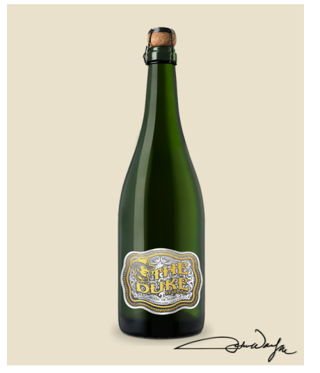
The Duke - Reserve Sparkling Blanc de Noirs - Napa Valley

Suggested Fine Dining Wine List Pricing: $70 to $110