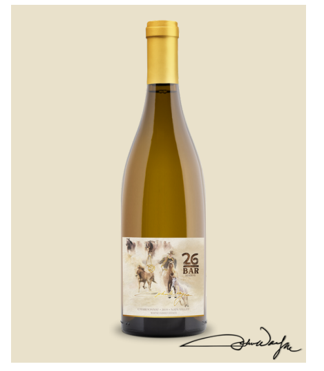
26 Bar - Reserve 2019 Chardonnay - Carneros, Napa Valley

Suggested Fine Dining Wine List Pricing: $120 to $180